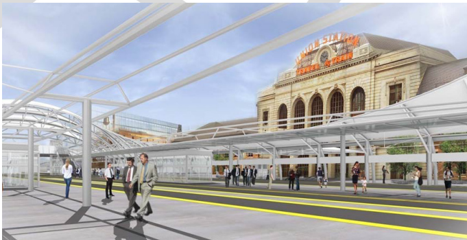
Train Hall View of Station

as many as 10,000 people an hour, the Train Hall honors the historic station while providing a dramatic new gateway to the Mile High City.