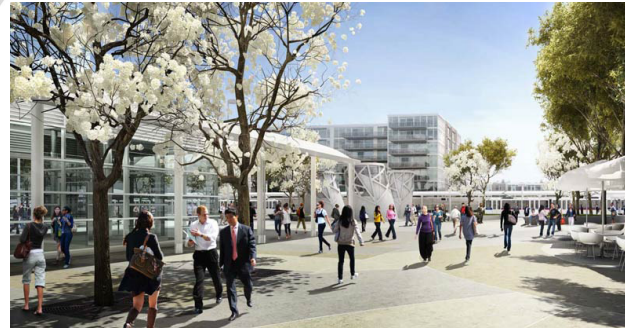
Light Rail Plaza

LRT platforms will be relocated adjacent to the CML to accommodate West, Southeast and Southwest light rail service. The project also will provide space for tail tracks north of the platforms to store additional trains. A plaza between LRT and Chestnut Place will include a signature canopy to provide shade and weather protection.