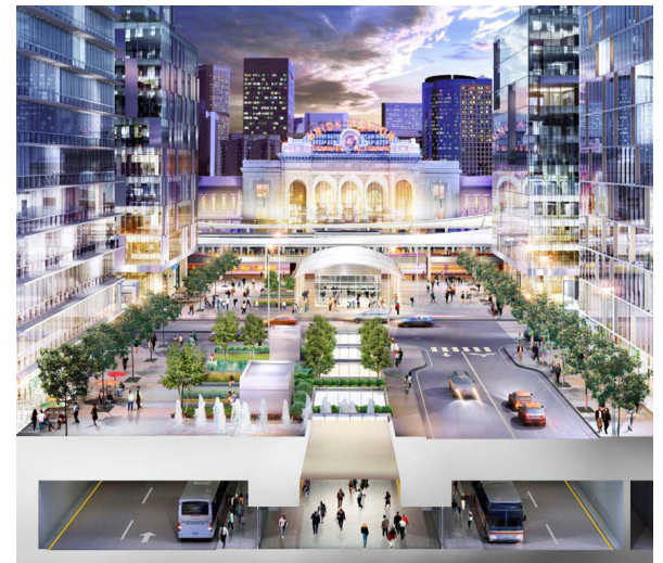
Regional Bus Facility and 17th Street Promenade

The free 16th Street Mall Shuttle will be extended to a location adjacent to the new light rail platforms at the Consolidated Main Line (CML), connecting Civic Center to the Platte River. The Shuttle will provide easy connections between LRT, commuter rail and the historic Station.