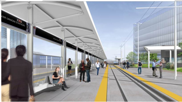
Light Rail Platform