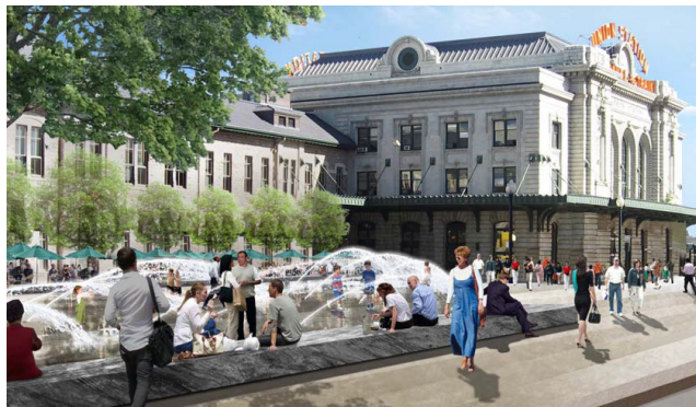
Wynkoop Plaza South

The historic Station will continue to have a prominent role in the new multimodal transit district. The interior waiting area (Train Room) will be rehabilitated to its historic prominence as a transportation gateway to Denver, connecting the east and west sides of the site.