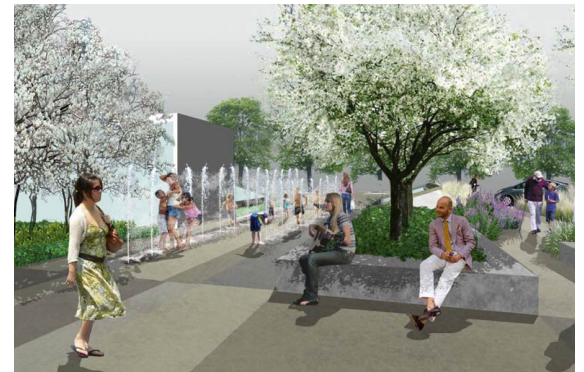
17th Street Gardens

The redevelopment incorporates several new significant public spaces, including the Wynkoop Plaza, the 17th Street Promenade/Gardens, the Wewatta Pavilion and the Light Rail Plaza. The public spaces will create a series of interconnected places that will tie the site together, allowing visitors to move easily from one destination to another.